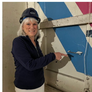
Thank you for helping get us to the hard-hat stage of this project!

Thanks to the incredible generosity of our community, we are finally in the demolition phase of this project! As this legislative session ends, there may be opportunities for you to help advocate for the bill so watch for more information. We are also working on closing the funding gap so we can fully complete this project. Please visit our website and social media for construction-related progress and watch for our updates in every edition of this newsletter this year.